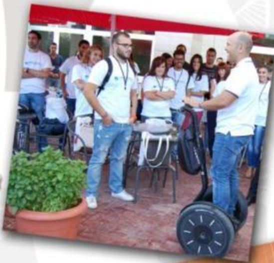
Orientation Event Sept. 2012